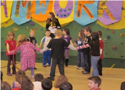
Getting the hoola hoop all the way around

February has been a month filled with lots of learning and lots of fun! Students and teachers enjoyed our second Celebration of the year on February 10 th . The focus was to celebrate the great teamwork that goes on here at TJ with kids and staff alike. The pictures below show some of the games the teachers and children played demonstrating teamwork.