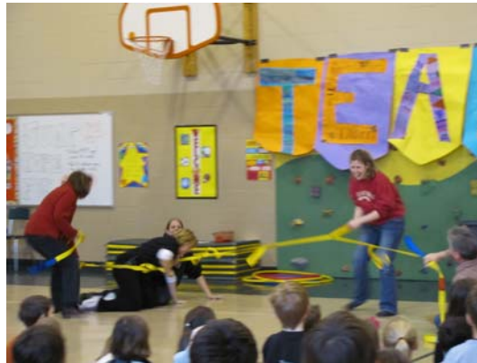
Great modeling of teamwork! ☺

We also celebrated perfect attendance for the 2 nd quarter and perfect attendance for the entire first semester: