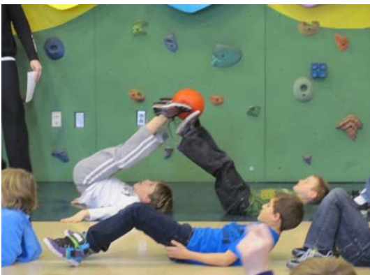
This takes real concentration and teamwork!!