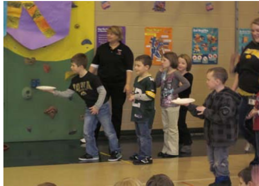
The Ping Pong Ball Race